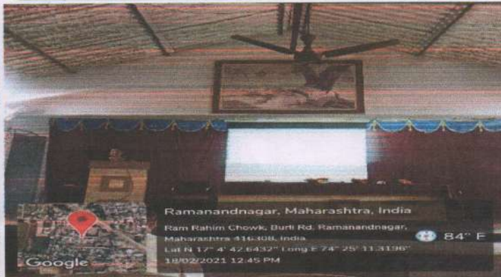
Resource Person Mr.Hemlata Gaikawad has delivered knowledgeable information about Moodle.