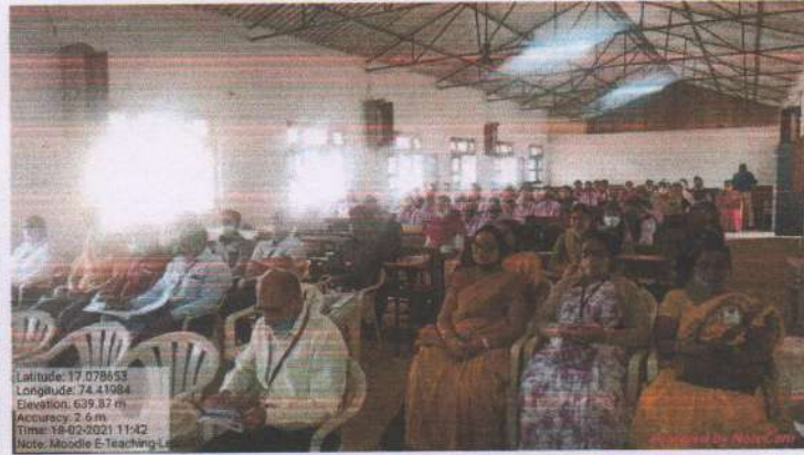
Teaching faculty and students had involve in the workshop.